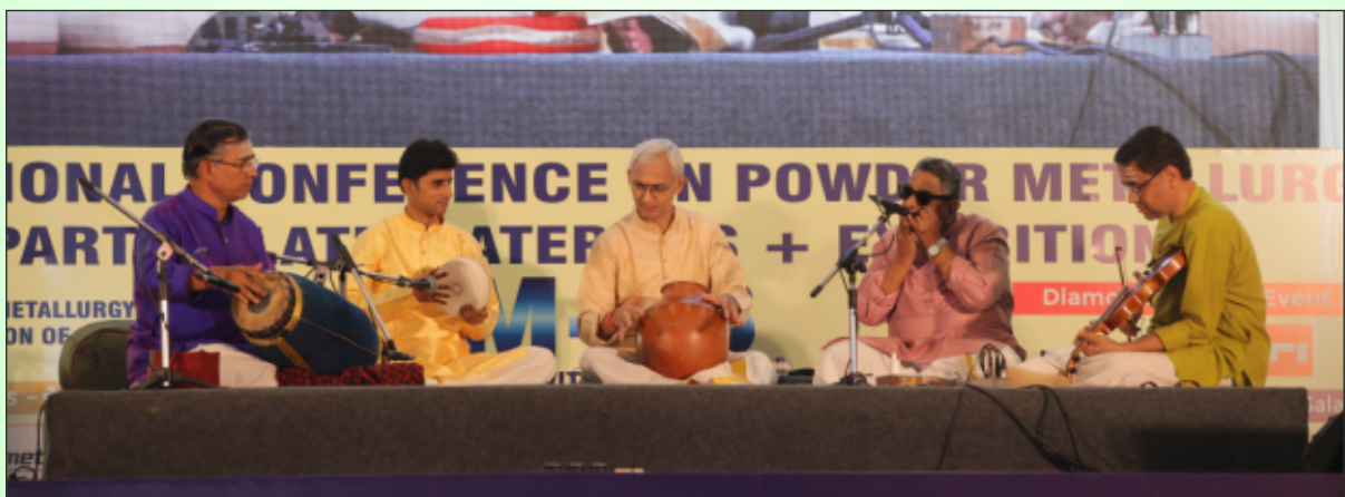
Layavinyasam: A Carnatic Music Showcasing Rhythm and Percussion Sponsored by Hilti Manufacturing India Private Limited