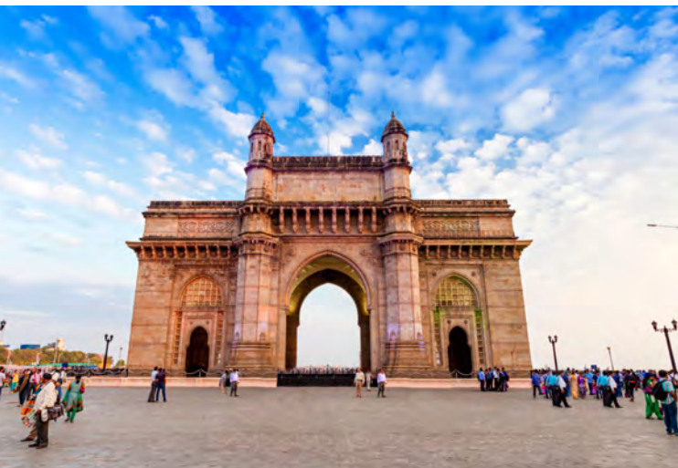
Gateway of India